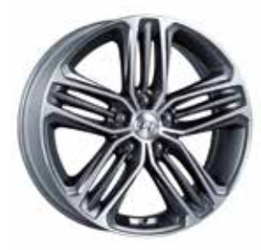
8″ alloy wheels