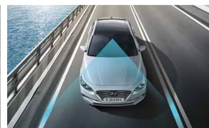
Around View Monitor (AVM)

Using a multi-camera system, AVM provides a near-360-degree view around the vehicle so you can feel safer and more confident.