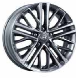
17" alloy wheels