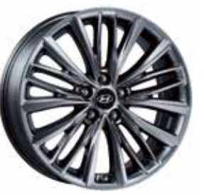
10" allov who