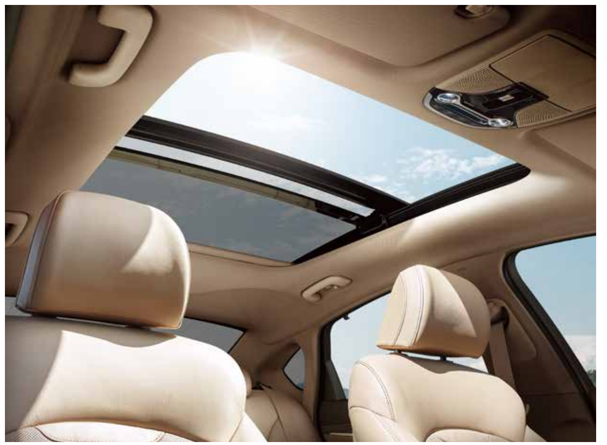
Prime Nappa leather seats Leather-wrapped door trim