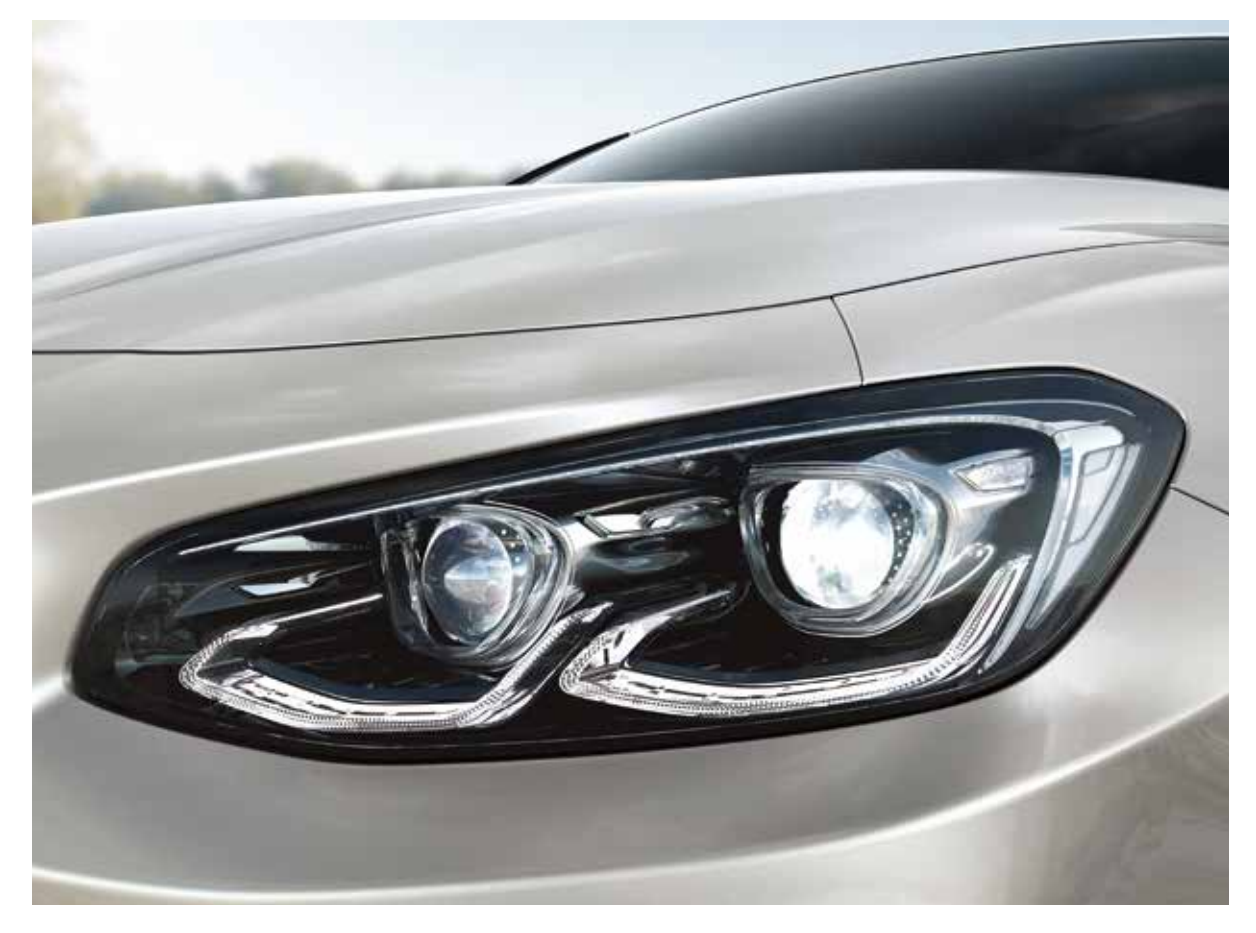
Full LED headlamps