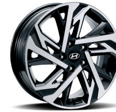
17" Diamond Cut Alloy Wheels