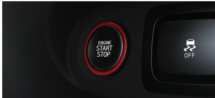
Push Start Button