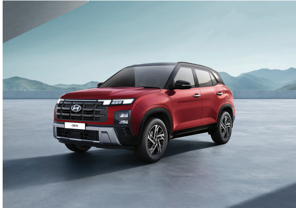
Black Chrome Parametric Front Grille