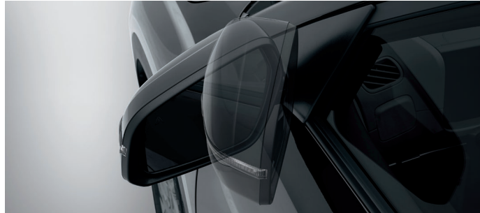
Outside Rear View Mirror - Power Folding