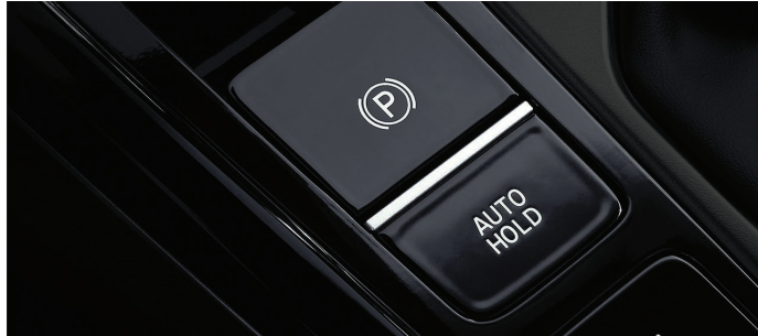
Electric Parking Brake