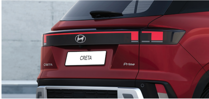
LED Rear Combination Lamp

With its progressive design and sharper curved lines, The New CRETA stands out effortlessly. Its futuristic look makes it the ideal SUV for urban life, empowering you to take on every journey with confidence.