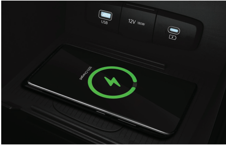
Wireless Smartphone Charging