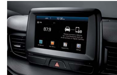
7" touch screen display