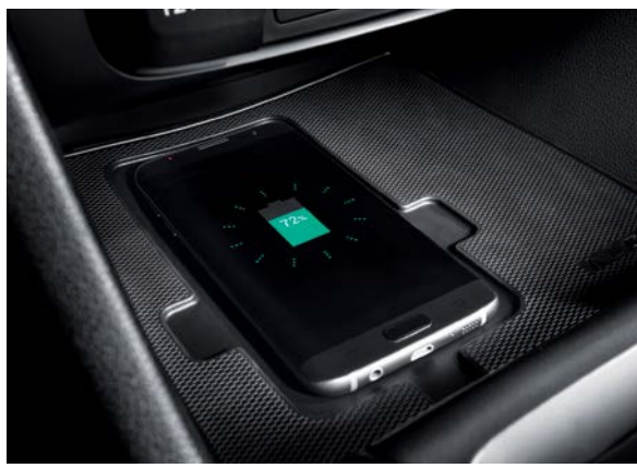
Smartphone wireless charging system