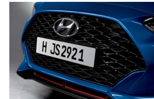
Cascading grille (mesh type) & Front bumper lip