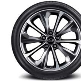
18" alloy wheel