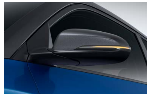
Exterior mirrors with LED indicator