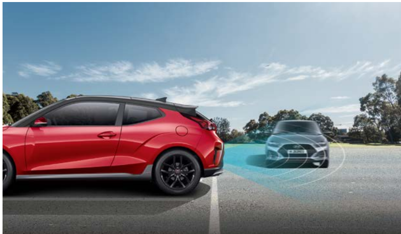
Rear Cross-Traffic Collision Warning (RCCW)