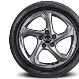
17" alloy wheel