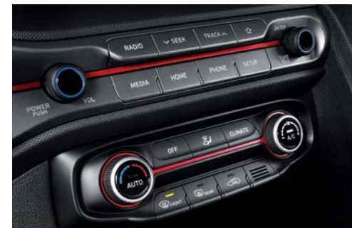
Full auto air conditioning with auto defog