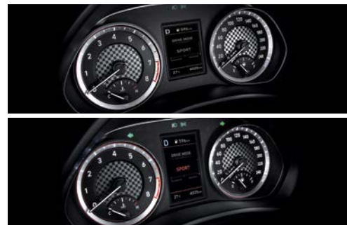
3.5" cluster / 4.2" supervision cluster (2.0 MPI)