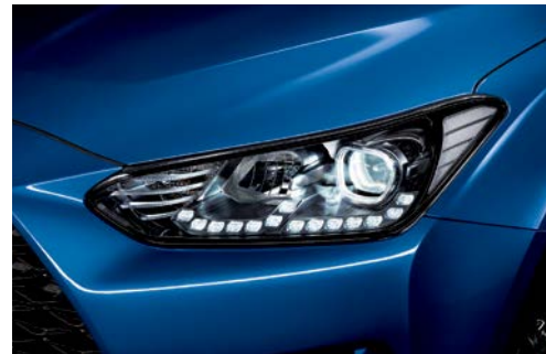
LED headlamps with LED DRL