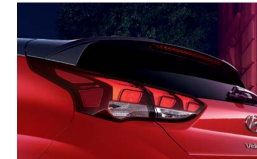
Rear spoiler / Rear LED lamps (for 1.6 Turbo)