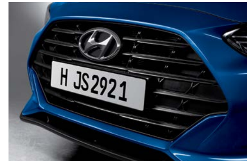
Cascading grille (horizontal bar type, 2.0 Engine only)