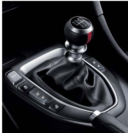
6-speed manual transmission (for 1.6 Turbo)

Breathtaking. Powerful. Mind-blowing. Words don't even come close to what it actually feels like driving the new Veloster. The unique agility of how it takes every curve. The satisfying sporty sound when you hit the gas pedal.