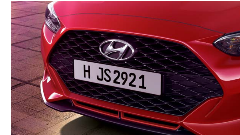
Radiator grille (for 1.6 Turbo only)