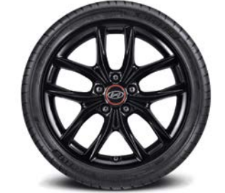
18" alloy wheel