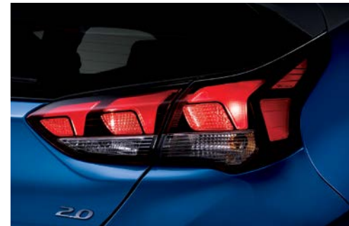
Rear combination lamps (bulb type)