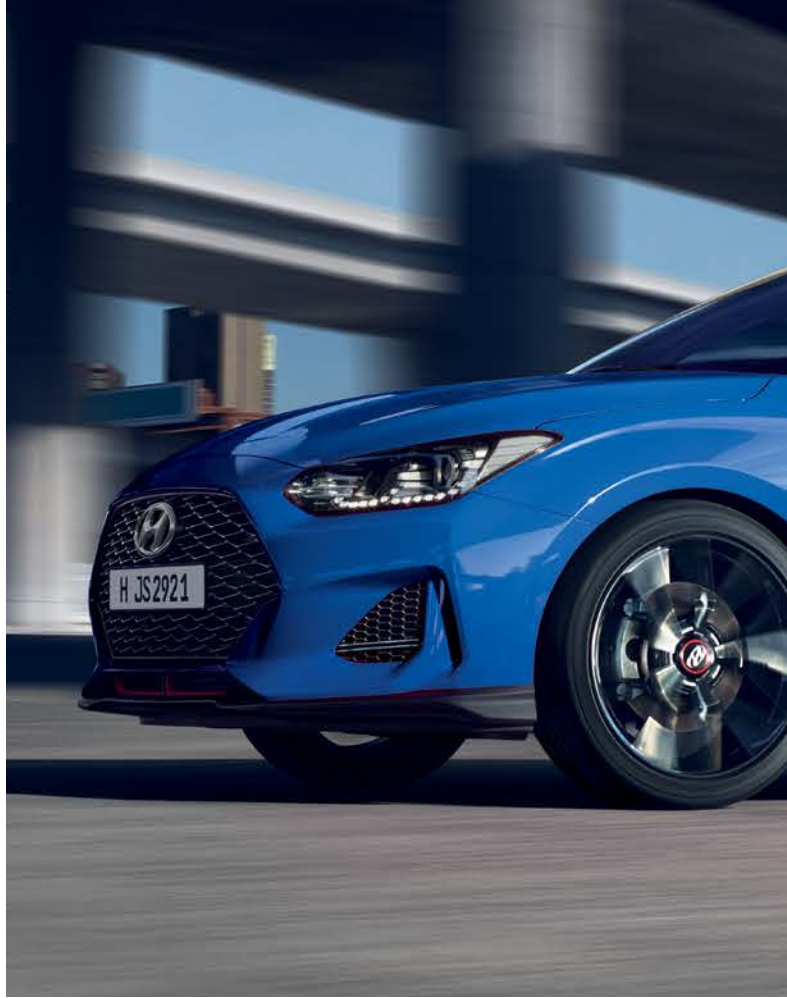
Cobalt eclipse bodycolor