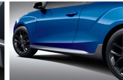
Side sill molding