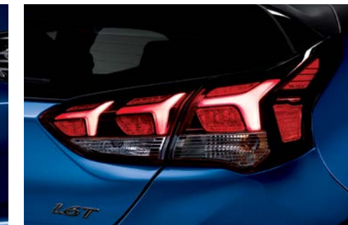
Rear LED lamps