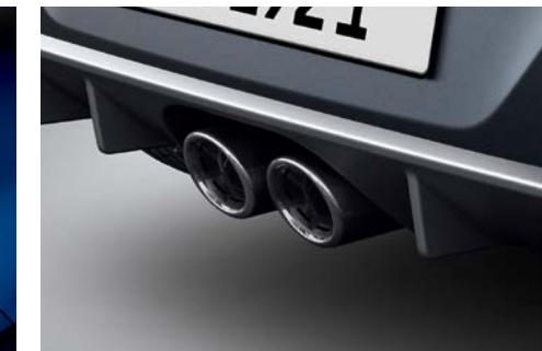
Center twin tip muffler