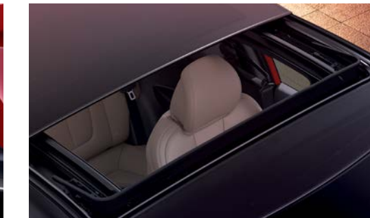
Wide type sunroof