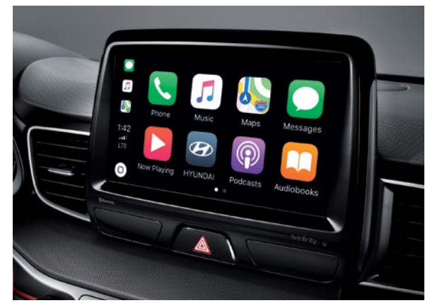
Smartphone connectivity (Apple CarPlay, Android Auto)