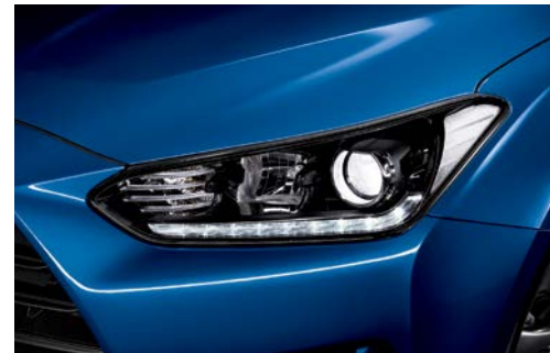
Projection headlamps with LED DRL