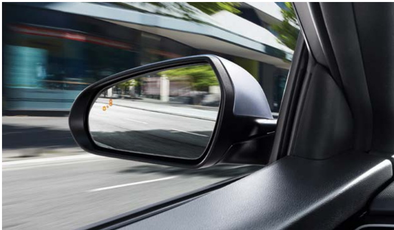
Blind-Spot Collision Warning (BCW)

This car won't just get you all the gazes—it also looks out for you. Equipped with Blind-Spot Collision Warning (BCW) and Rear Cross-Traffic Collision Warning (RCCW) it will always keep you safe and sound in your own motorized realm.