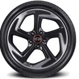
18" alloy wheel