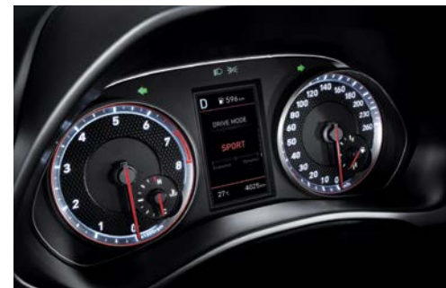
4.2" supervision cluster (1.6 Turbo)