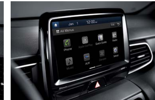
8" touch screen display