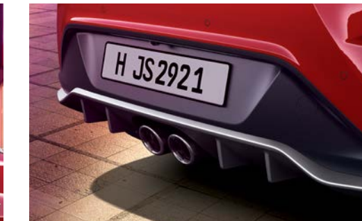
Center twin tip muffler (for 1.6 Turbo only)