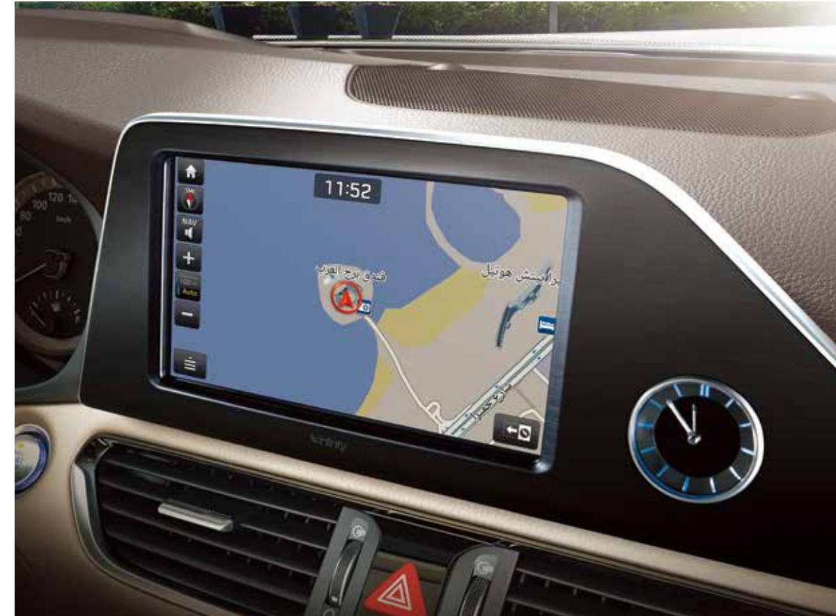
8" audio and navigation display