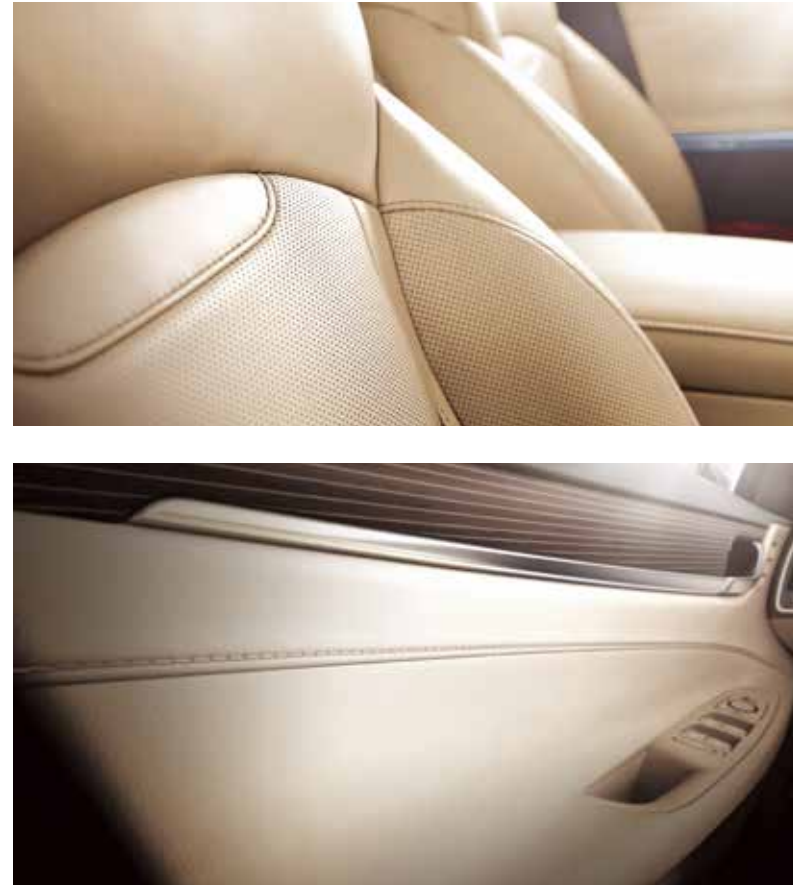
Prime Nappa leather seats Leather-wrapped door trim