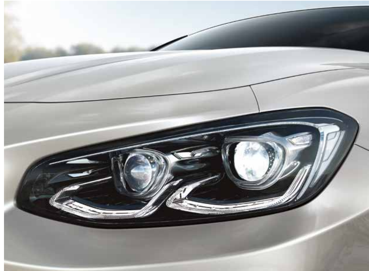
Full LED headlamps